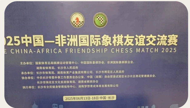
ORGANIZERS AND SPONSORS OF THE CHINA- AFRICA FRIENDSHIP CHESS MATCH